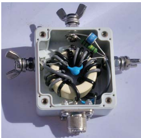
PHOTO 2: The 1:1 transformer and associated parts. The black wires connect to the SO239 input socket and the grey wires to the loop counterpoises and vertical antenna.