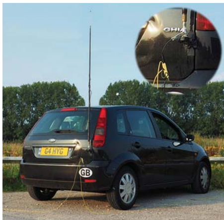
PHOTO 3: Using a loop counterpoise from a parked car (inset shows the alligator clip connecting the loop to the ground part of the antenna mount).

a third loop counterpoise over the other two counterpoises, which proved that they can be overlapped. As the loop counterpoises are not resonant, their size, shape or any overlap is not critical. Just use the area you have available to lay insulated wire in loops.