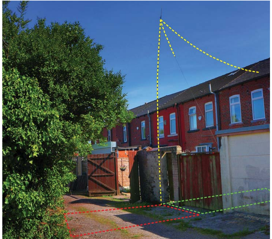
PHOTO 1: General layout of my two-loop restricted space vertical with two grounding loops. Yellow marks the G7FEK vertical antenna; red and green denote the two loops, with the rightmost (green) loop running around my back yard behind the gate. The transformer (not shown) is at the base of the vertical.

Following this I tried both my LoG antennas at home and the workshop connected as loop counterpoises to the ground terminal of